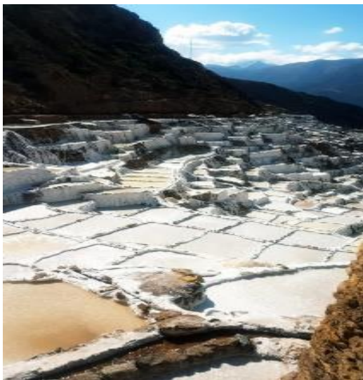
Maras Salt mine